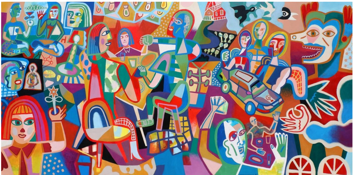
Abenk Alter · Ritual Merilis · 2021 · Acrylic on canvas · 200 x 400 cm