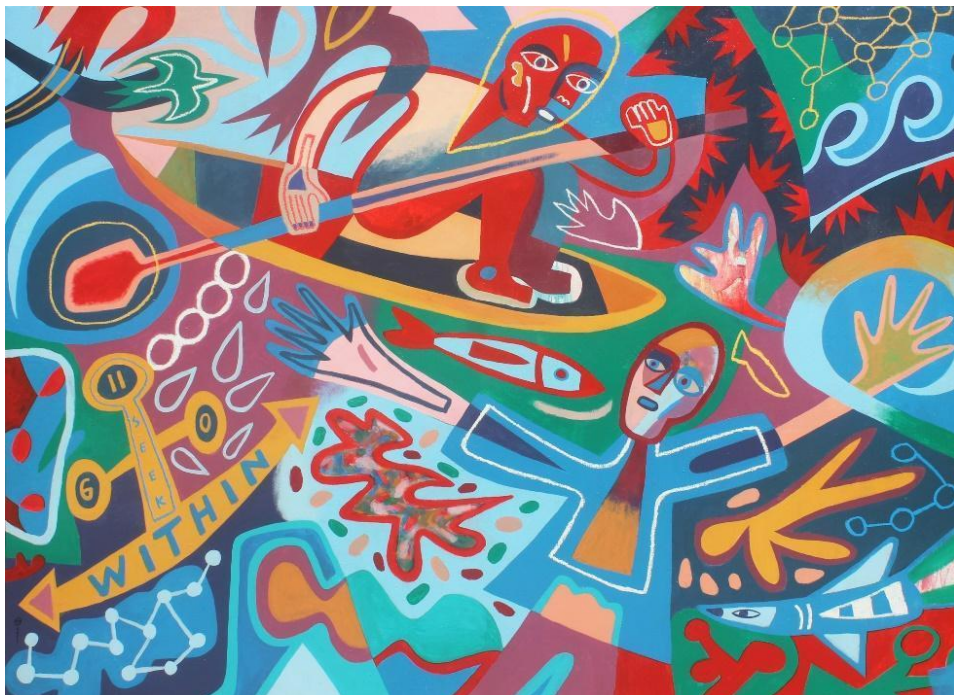
Abenk Alter · Tanda Jeda · 2021 · Acrylic on canvas · 180 x 240 cm