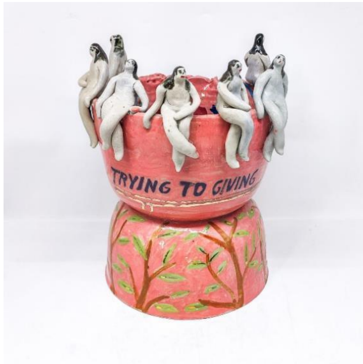
Sekarputi Sidhiawati · Team Up · 2019 · Hand throwing stoneware, handbuild, engobe, glaze, and gold lustre · 23 x 17,5 x 17,5 cm