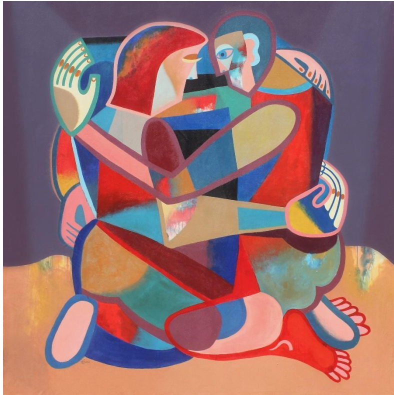
Abenk Alter · Ruang Tengah · 2021 · Acrylic on canvas · 200 x 200 cm