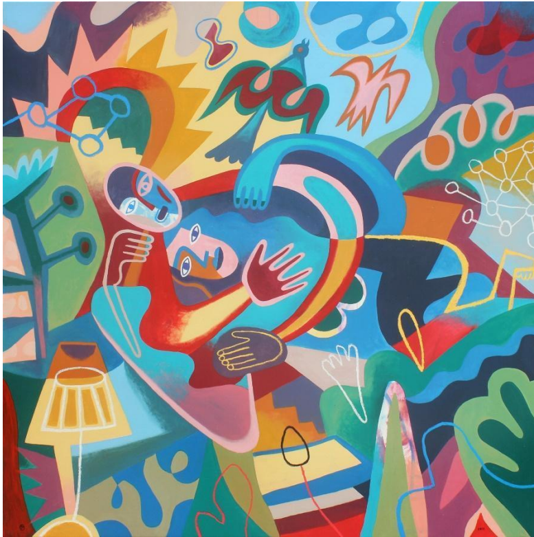
Abenk Alter · Peaceful Garden (Alignment 2) · 2021 · Acrylic on canvas · 200 x 200 cm