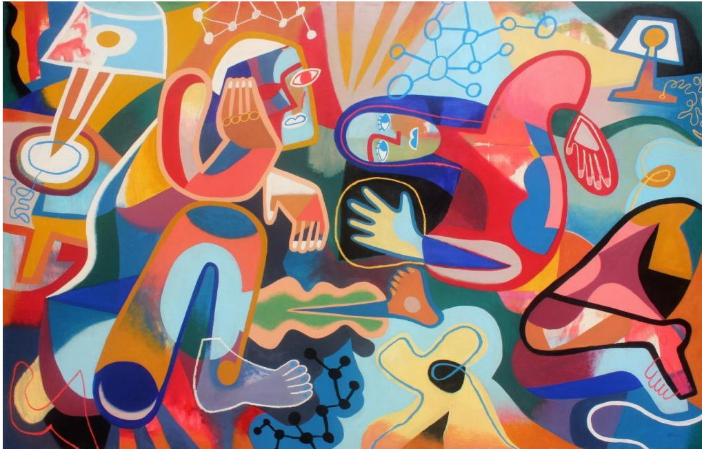
Abenk Alter · Lights On (Alignment 1) · 2021 · Acrylic on canvas · 200 x 300 cm