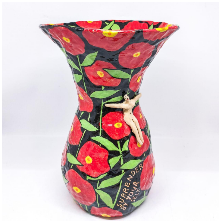
Sekarputi Sidhiawati · Surrender · 2021 · Hand build stoneware, engobe, glaze, and gold lustre · 26 x 18 x 10 cm