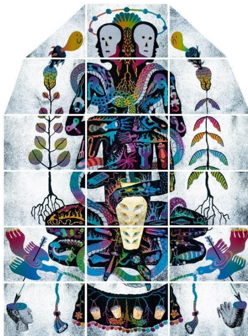
Agugn · Human Supremacy, edition 2_3 (2020) · Linocut reduction print with silver, gold and copper leaf on handmade recycled paper · 157 x 125.5 cm