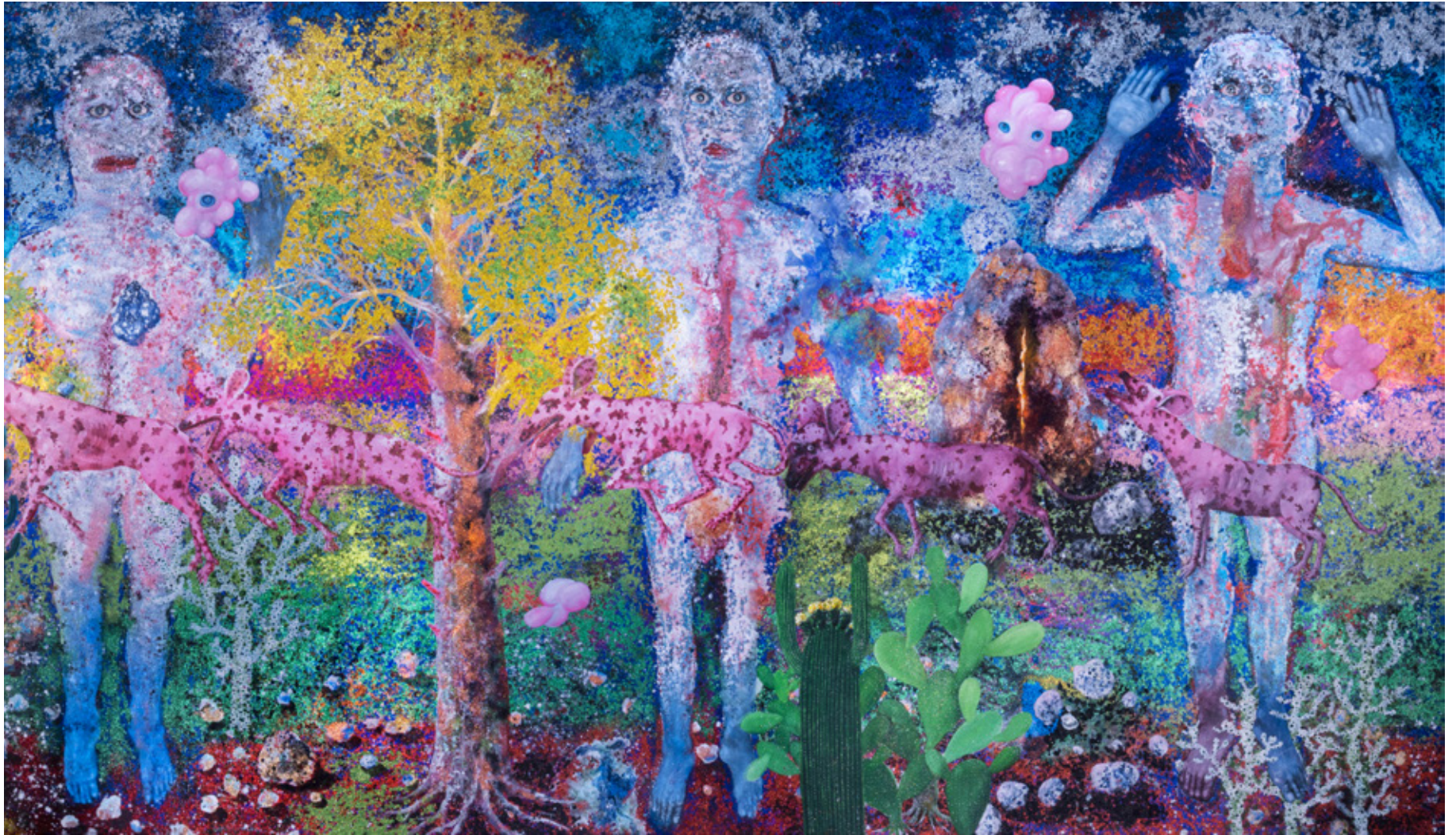
Detail of Flammable Memory