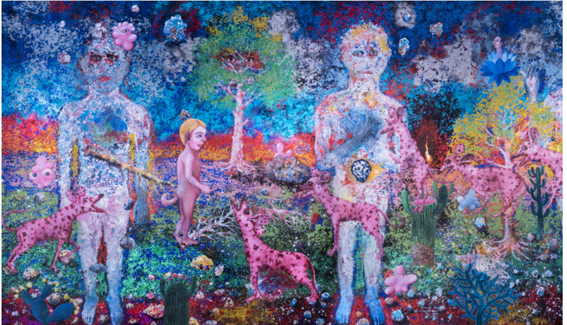
Detail of Flammable Memory