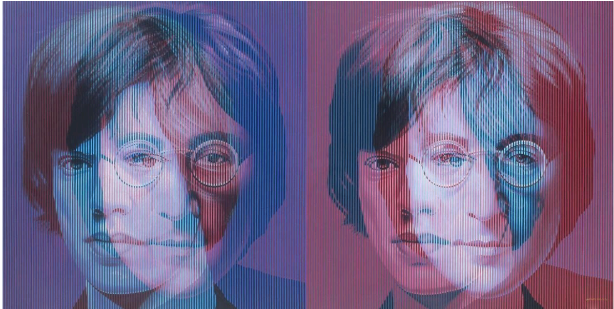
Galam Zulkifli · Seri Ilusi Vol 1, Lennon Jagger · 2021 · Acrylic and Brand tape on canvas · 150 x 300 cm