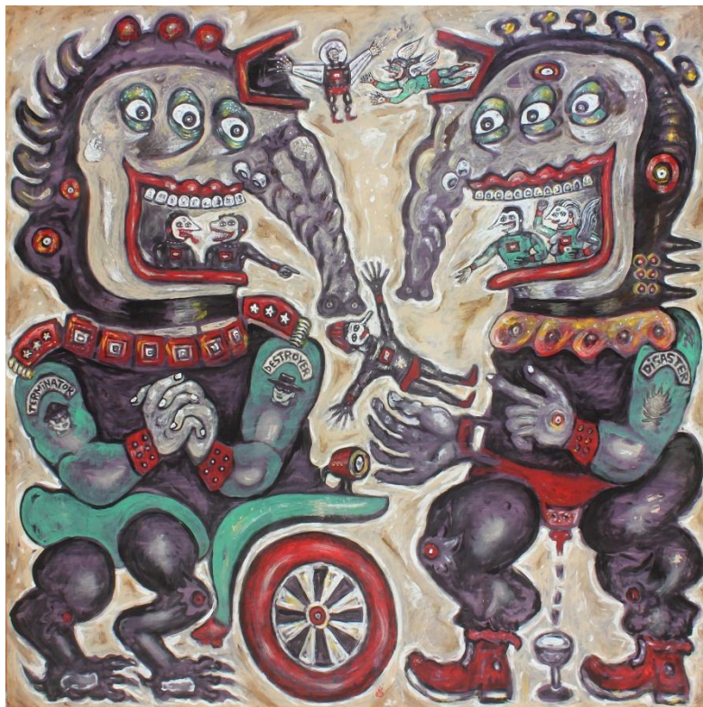
Heri Dono · Catastrophe & Survival · 2021 · Acrylic on canvas · 180 x 180 cm