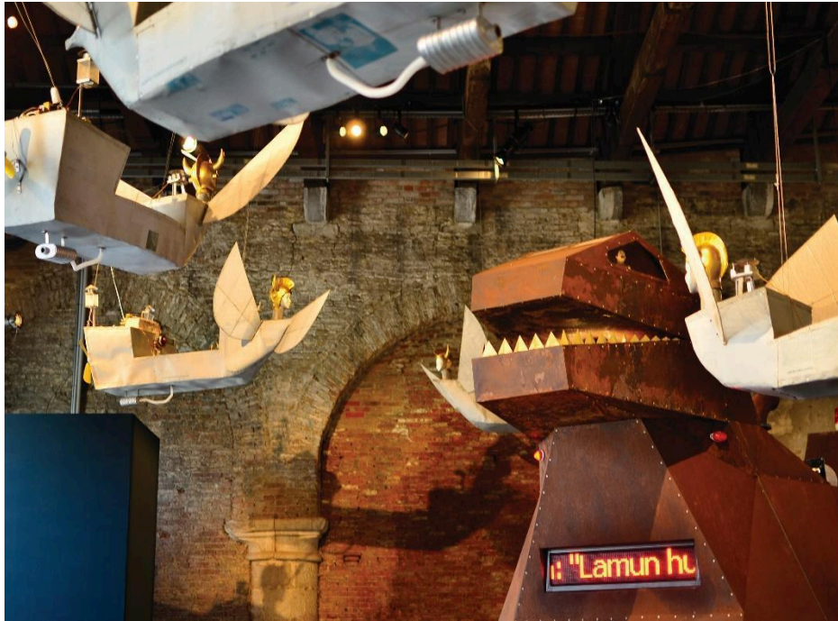
Heri Dono · Voyage Trokomod · 2015 · Pavilion of Indonesia, 56 th Venice Art Biennale