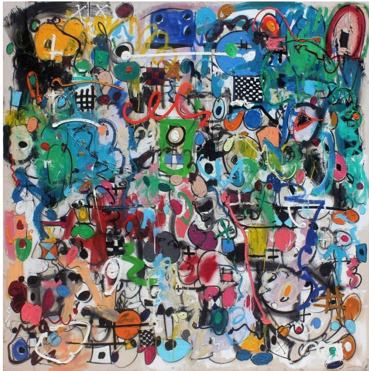
SWORD SWALLOWERS · 2020 · mixed media on canvas · 200 x 200 cm