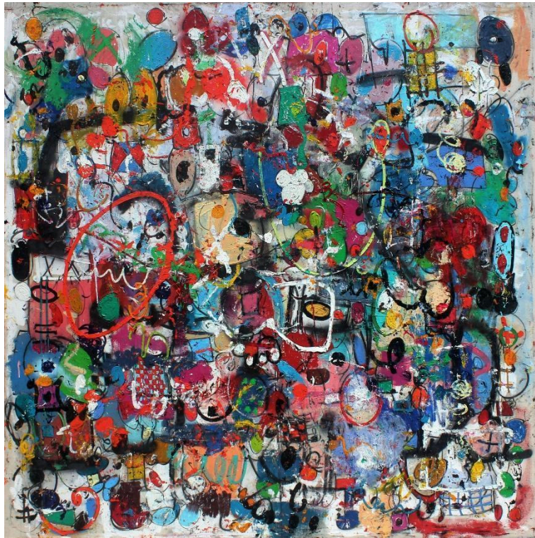
THE SINGING WHALES · 2020 · mixed media on canvas · 200 x 200 cm

Attachment: Some of the exhibit artworks: