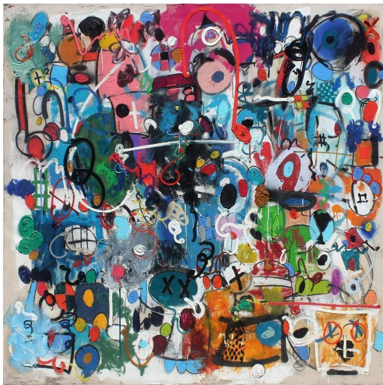
DOUBLE TRAPEZE · 2020 · mixed media on canvas · 180 x 180 cm