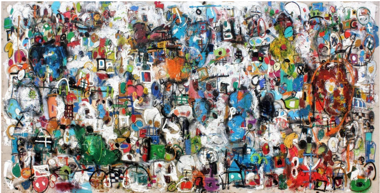
A TIGER IN FLAMING HOOPS · 2020 · mixed media on canvas · 200 x 400 cm